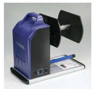
Stylish appearance plus a rugged design for long term reliability