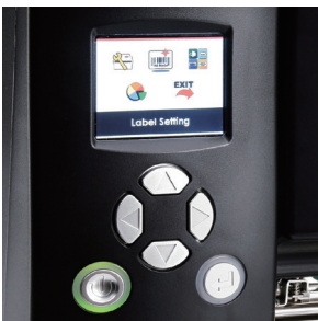
Color TFT LCD and operation panel for easy and intuitive operation

All metal mechanism design featuring die-cast center plane and base make EZ2250i series perfect for high volume applications