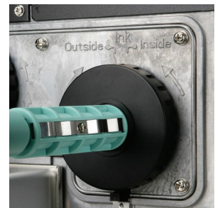
Automatic self adjustment for coated inside/outside ribbons